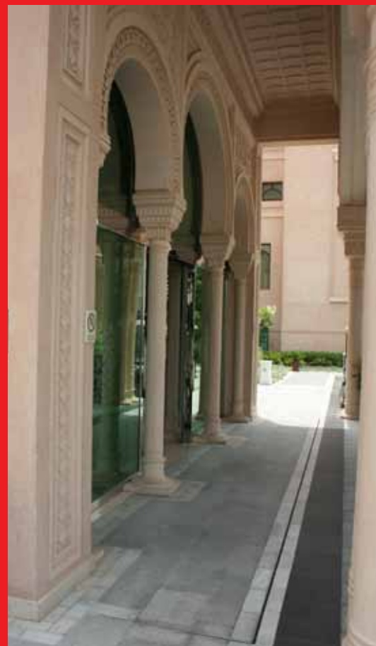
ACO N - channels with Brickslot Elements