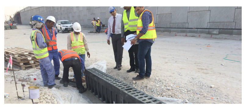
During installation in 2015