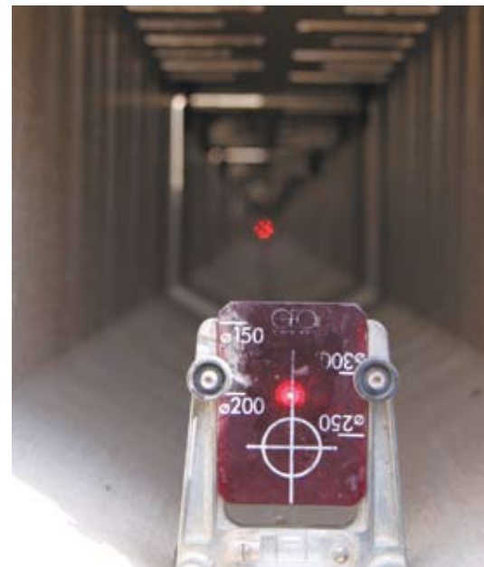
Levelling of the channel elements to a length of ca. 200 metres