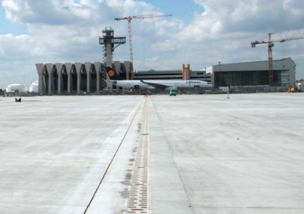
ACO DRAIN® Monoblock RD 300 V in the area of the A West apron

a total area of 95,000 m 2 , can take ca. 1,700 litres of water per second and safely drain it away. Also with regard to environmental protection, the planners have made the right decision in choosing the ACO DRAIN® Monoblock RD 300 V: the building material, polymer concrete, due to the fact that it is composed of mineral filling materials and reaction resin, is impermeable to fluids without it needing an additional coating; it is also resistant to aggressive media such as kerosene and de-icing agent.