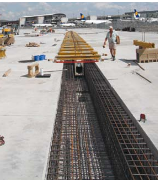
Prepared foundation ditch with steel reinforcement

In installing what are in any case extremely durable channel elements, a special design was selected. The levelled-out elements were linked up with one another on a freely suspended basis, forming a force-fit unit with the foundation after the concrete has been put into place. That way, an additional load transfer and the absorption of lateral shearing forces are guaranteed.