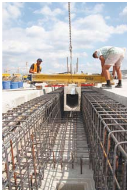
Suspending the ACO DRAIN® Monoblock RD 300 V as it is put into place