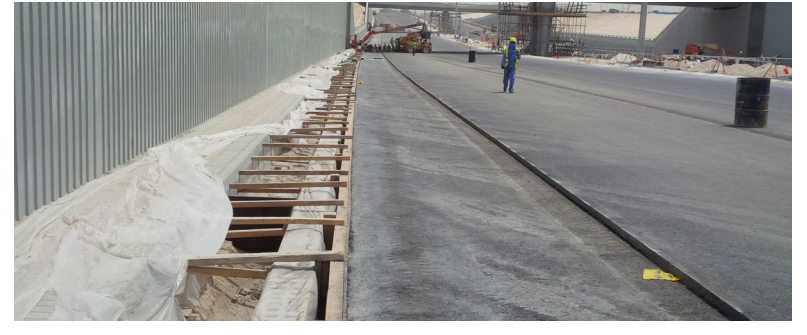
During installation in 2014