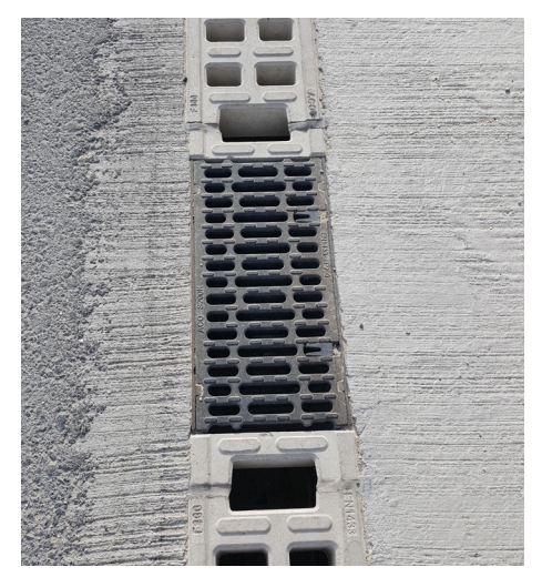
ACO Monoblock access unit with cast iron grating