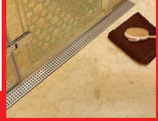
ACO Shower channels in the baths of the guest rooms

ACO Kitchen channels in all kitchens of the restaurants