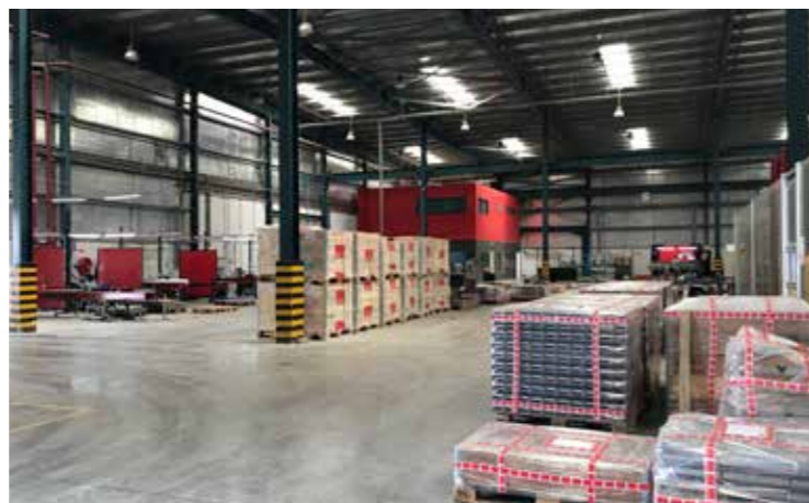
Manufacture and Warehouse Facility, located in the Jebel Ali Free Zone Dubai