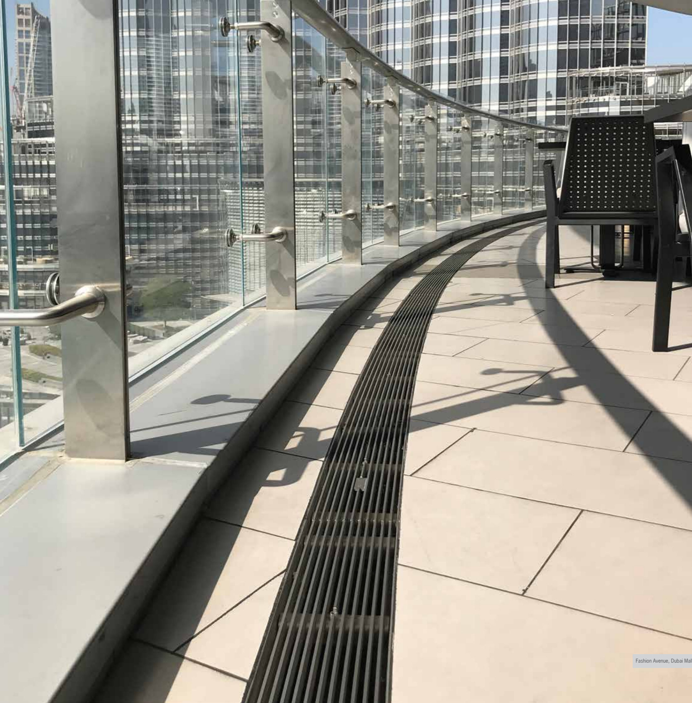
Fashion Avenue, Dubai Mall