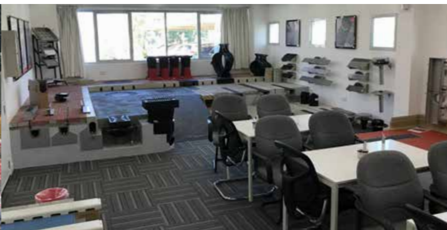
The ACO Showroom, located in the Jebel Ali Free Zone Dubai, Street 100, Building 07

ACO Service for all GCC countries, the Middle East Region and parts of South Asia