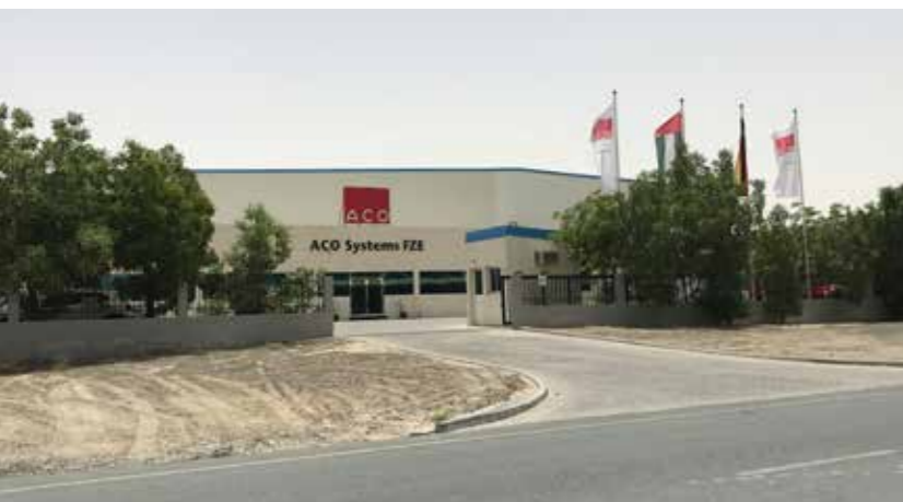
ACO Systems FZE in Dubai, United Arab Emirates

ACO Systems FZE - ACO Headquarter for the GCC countries, the Middle East region and parts of South Asia