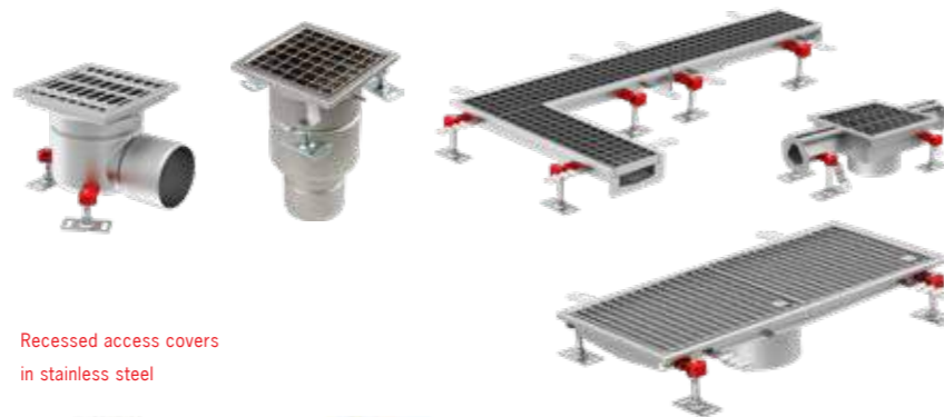
Recessed access covers in stainless steel