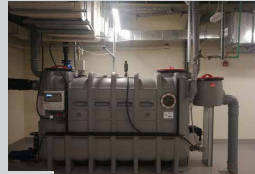
Marsa Al Seef, Dubai