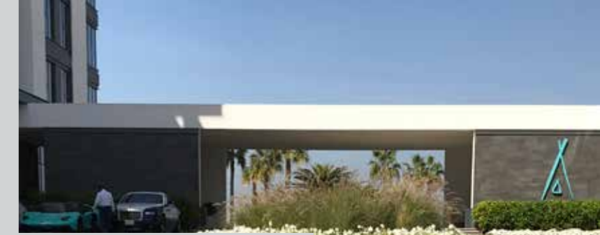
Nikki Beach Resort & Spa at Pearl Jumeirah Island, Dubai