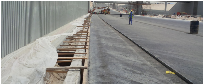
During installation in 2014