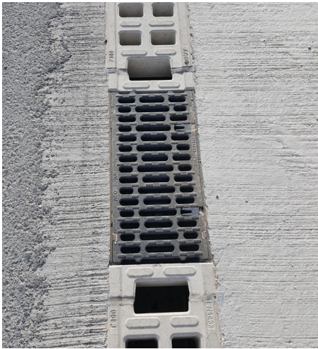
ACO Monoblock access unit with cast iron grating