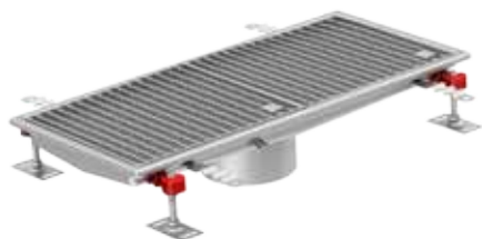
ACO Box Channel with gratings in stainless steel

Commercial Kitchen environments, hot water and grease must be counteracted by more complex and sophisticated drainage concepts. ACO achieves this with intelligent system solutions which address food safety, people and water protection. Every product within the ACO system safely controls the water as it passes along the chain to ensure that it can be hygienically, economically and ecologically handled.