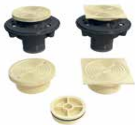
ACO Cleanouts in cast iron with Nickel Bronze Tops

Nickel Bronze floor grates and covers are available both as screw-fastened and hinged options. There are a number of options of outlets available.