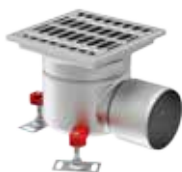
ACO Gully with grating in stainless steel