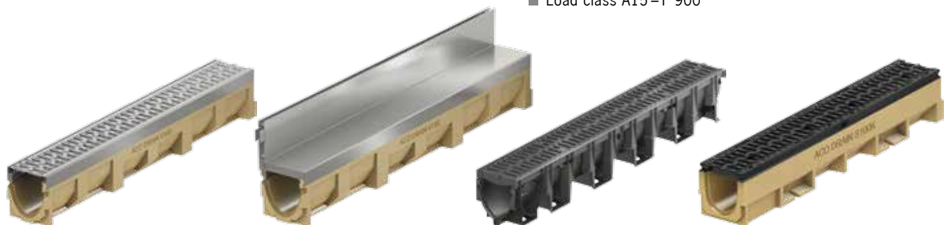
ACO DRAIN® Multiline