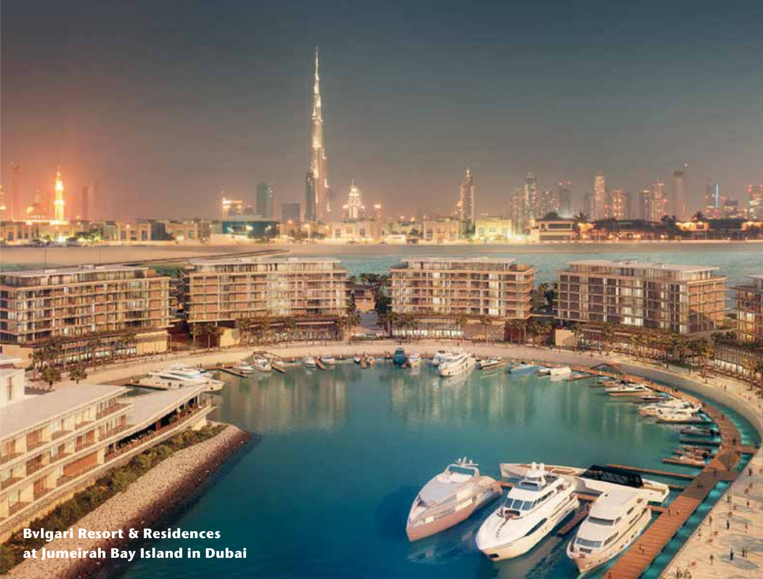
Bvlgari Resort & Residences at Jumeirah Bay Island in Dubai