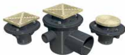
ACO Floor Drains in cast iron with Nickel Bronze Tops