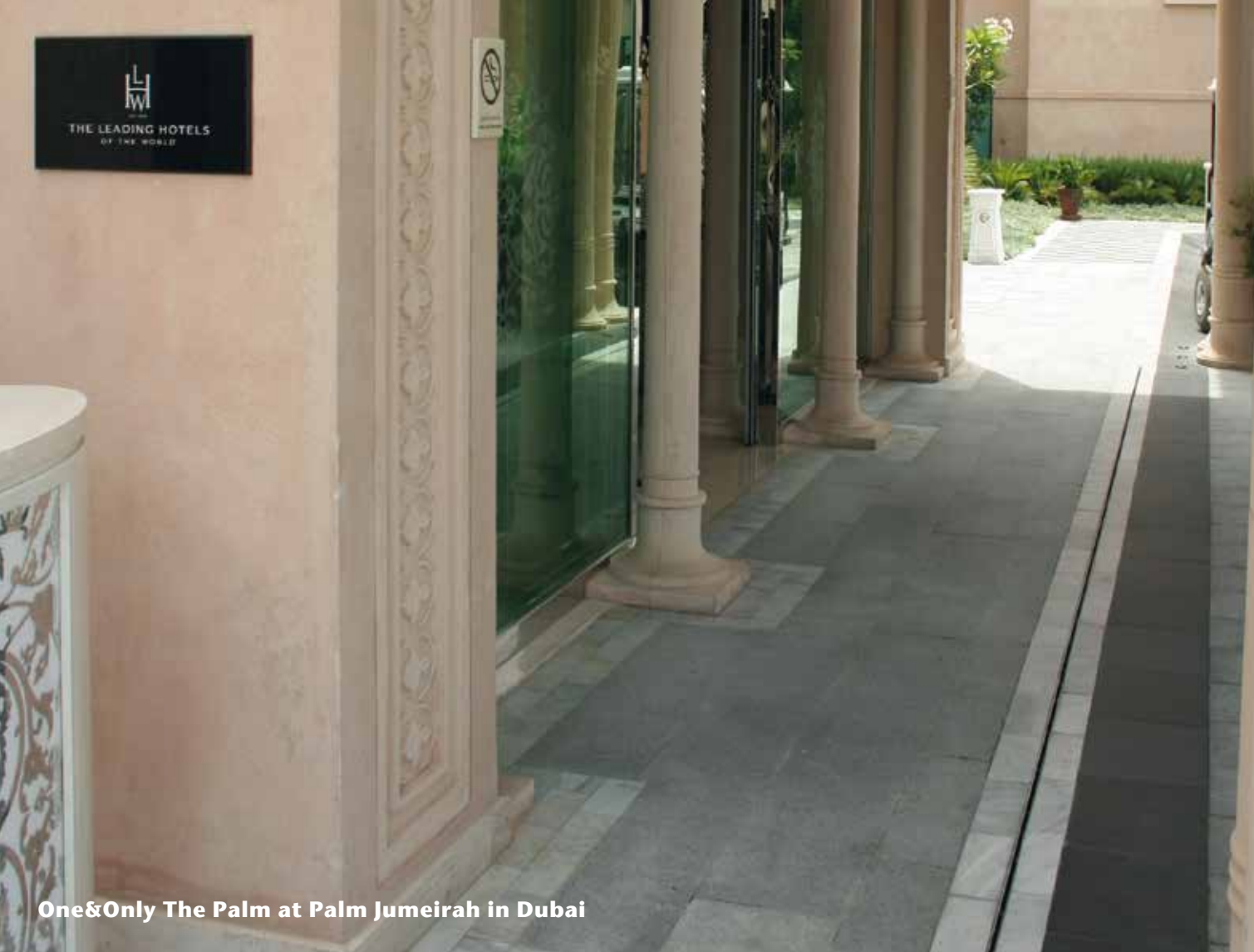
One&Only The Palm at Palm Jumeirah in Dubai