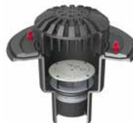
ACO Spin Roof drain

In the light of the general increase in the occurrence of heavy rainfall, we have adjusted to the changing conditions and developed a complete system which delivers the optimum drainage solution for every situation.