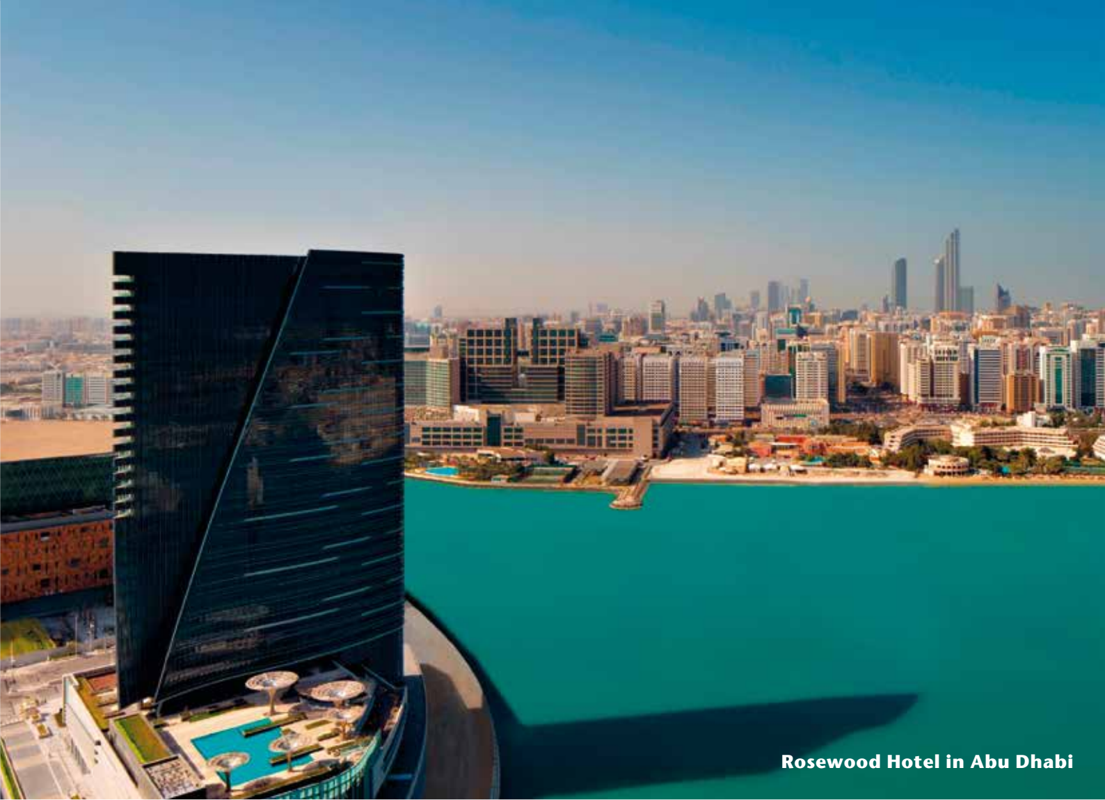
Rosewood Hotel in Abu Dhabi

Are you searching for optimal water treatment solution?