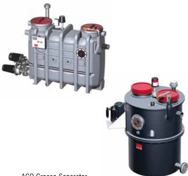
ACO Grease Separator for full disposal